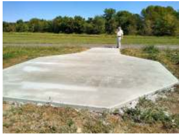
Cecil Stokes checking out the pad before sign installation.