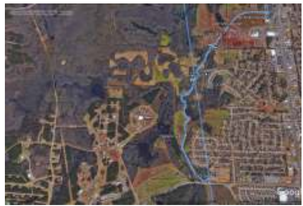
Thiokol Greenway and Grissom Greenway is light blue line projected onto Google Earth map. Thiokol Line 2 is in center of map. Bell Mountain Park is at bottom of greenway line and Haysland Square is at top of greenway line.