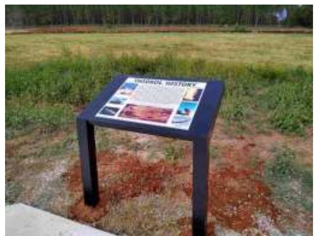
Thiokol History sign is installed.