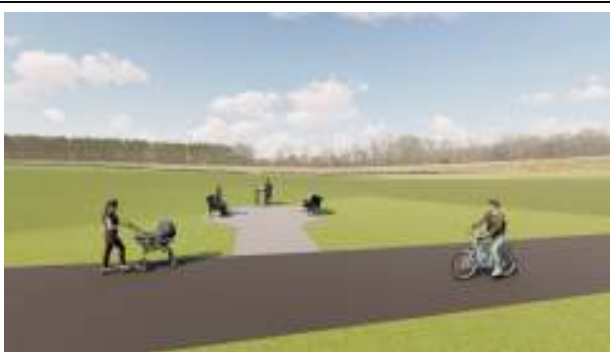
Graphic of Thiokol Greenway showing the pad, sign, and benches. Thiokol Line 2 is just across the arsenal boundary in front of the sign.