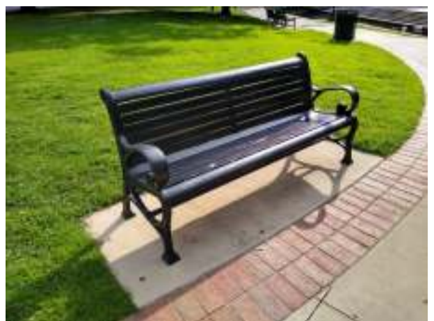
The final step in the installation will be the addition of two benches. (This photo from Big Springs Park. Thiokol Greenway benches will be identical.)