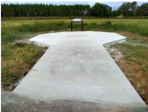
Tah dah! Fanfare please. Pad and sign installed week of September 20.